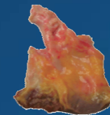
Hemi Pulmonary Artery